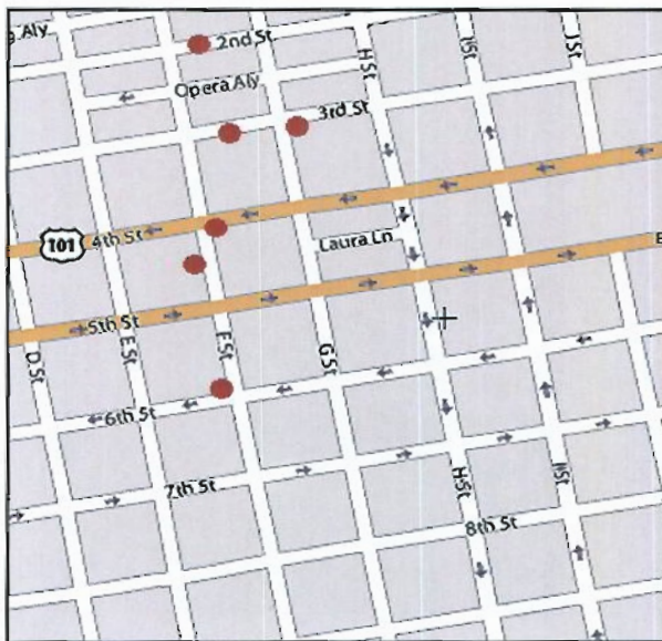
Map of Milstead donated sculpture locations