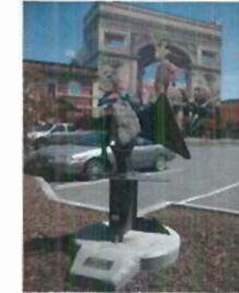
Untitled by Luigi Testa located at 4th and F Sts

A 2002 study done by a San Francisco-based firm referenced efforts of the Eureka Main Street program to capitalize on existing assets, the arts.